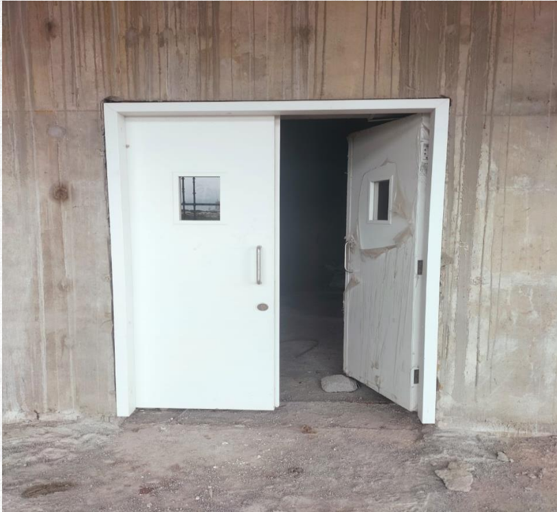
Fire doors Installation works are in progress