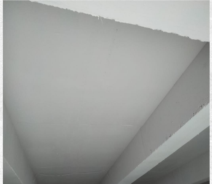
Basement Painting works