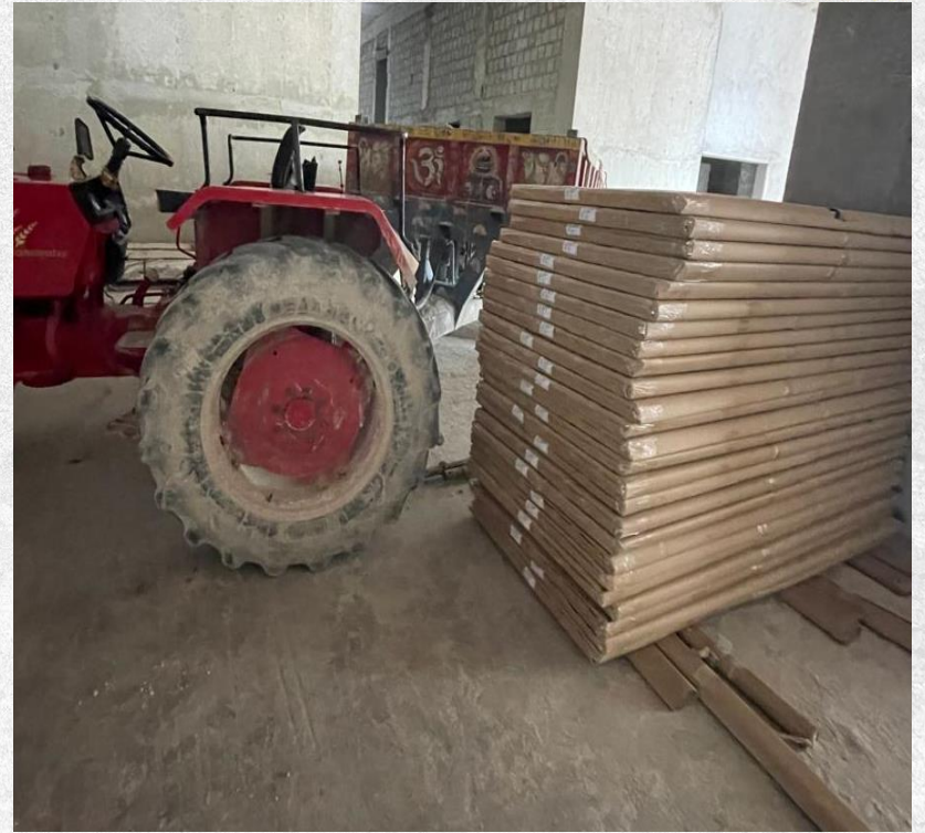
Fire Doors Delivered