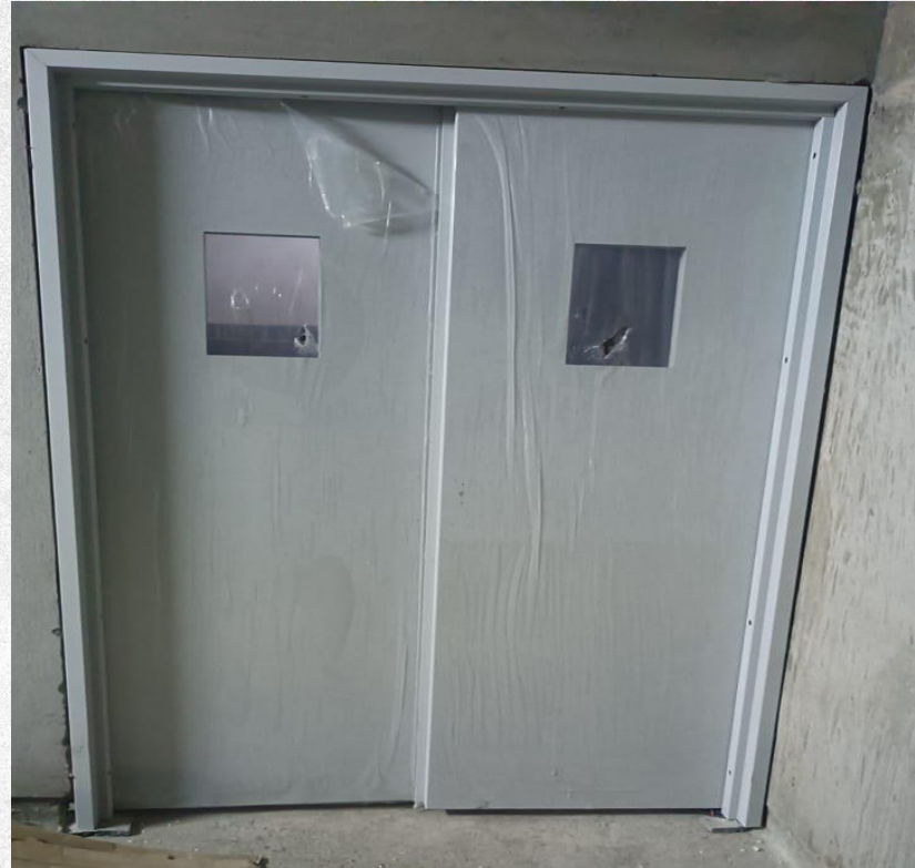
Fire doors installations are in progress