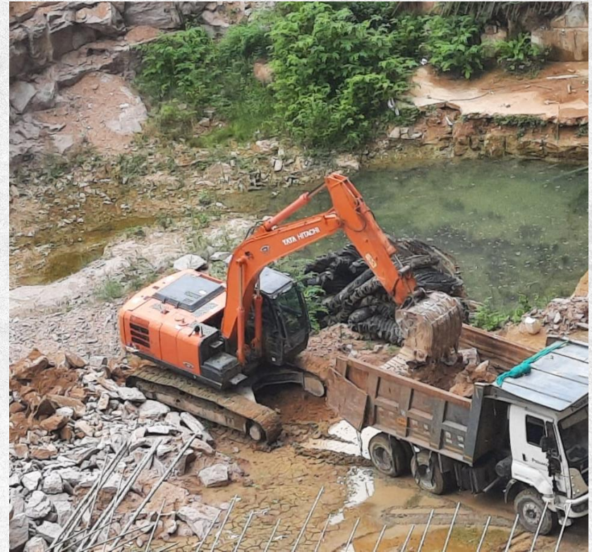
Excavation works in Tower B footprint are advancing