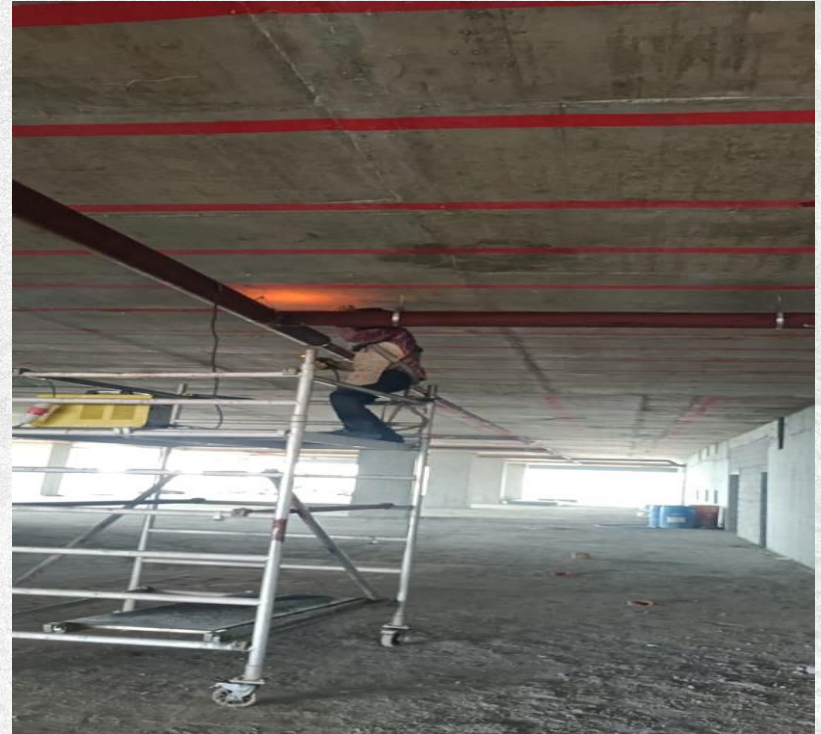
Fire Piping Installation In Level -28 and above(TOWER-A1)