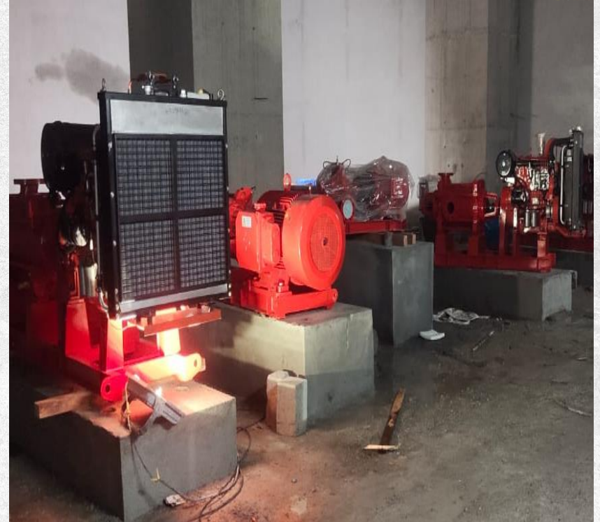
Fire Pumps Installation works are in progress