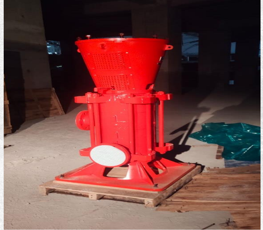
Fire Pumps Installation works are in progress