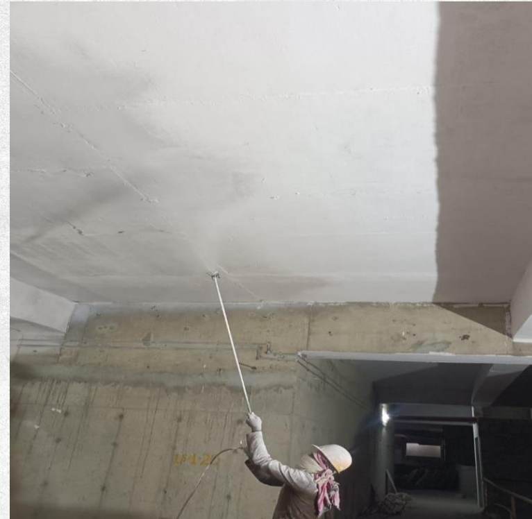
Painting works are in progress