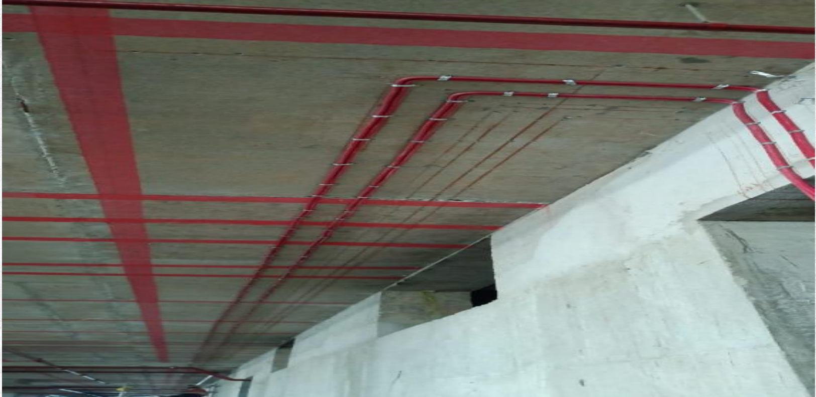
Fire Alarm Works are in progress