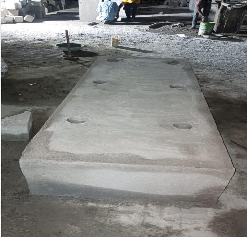
Fire pump Room works are in progress