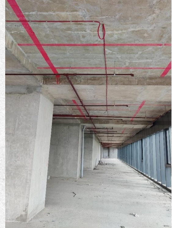
Fire Alarm cabling works at various levels in TOWER-A1