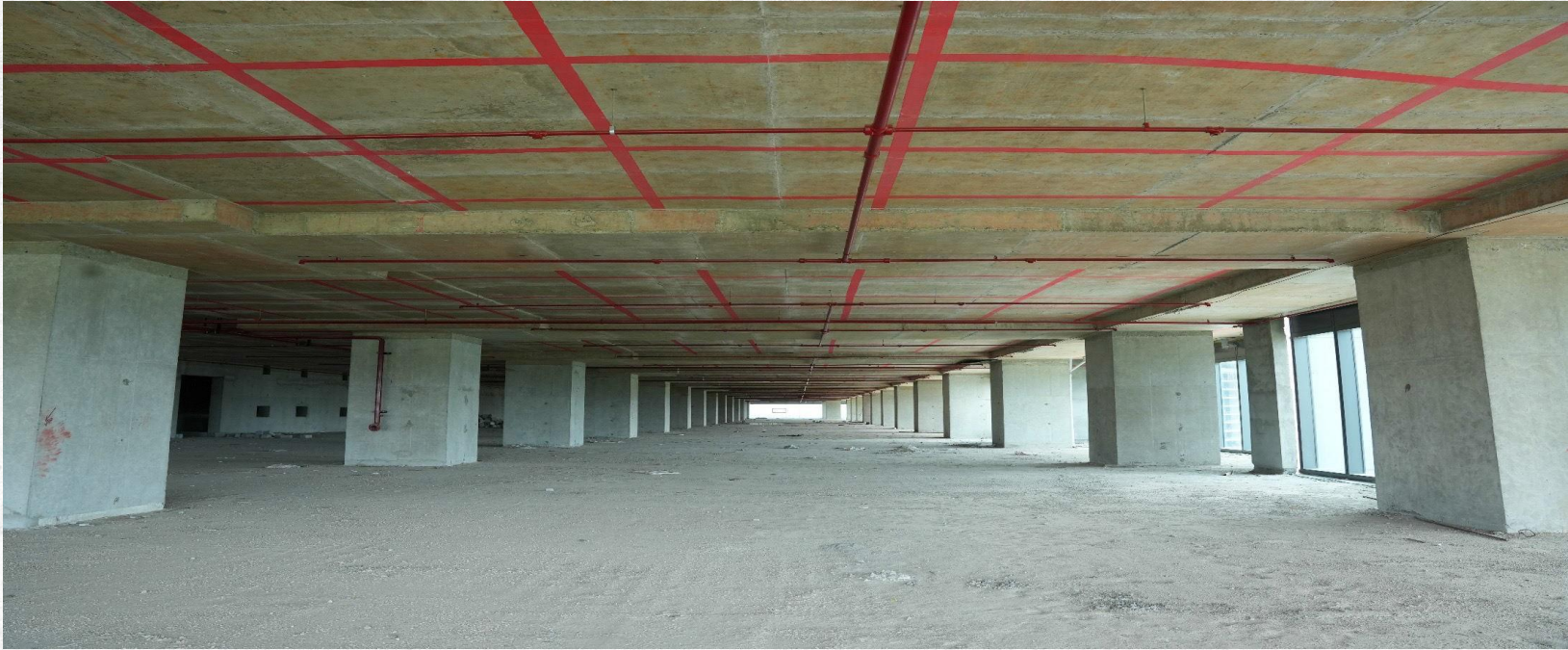
Sense of Largeness – Typical floor plate of 1,20,000 sqft.