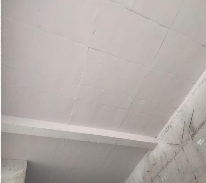
Basement Painting works