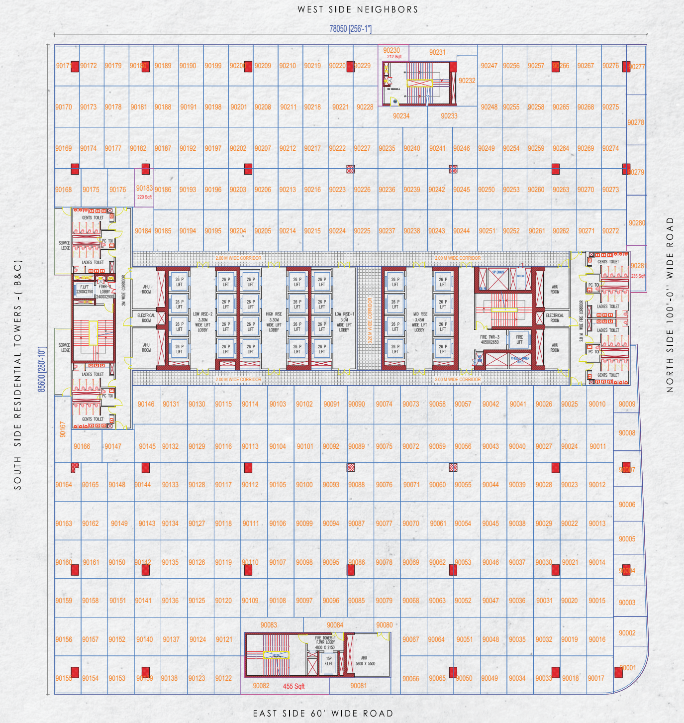
Typical Floor plan - 12 th A floor